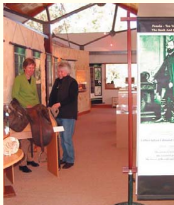
The Woods Exhibition in the Mary MacKillop Penola Centre focuses on his pioneering scientific work.

Visitors to Coonawarra who would like to know more about the life of this remarkable man will find a fascinating display, including an extensive fossil collection, in the Mary MacKillop Penola Centre.