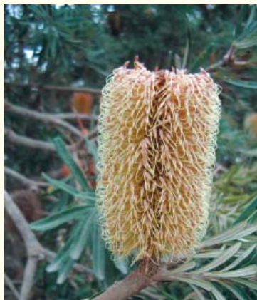
The Native Honeysuckle ( Banksia marginata ), 'with flowers like a large bottle-brush', that gave Coonawarra its name.

Woods was also a brilliant natural scientist, and wine lovers can acknowledge him as being the first to describe scientifically Coonawarra's famous terra rossa ridge. His Penola presbytery was located upon it,